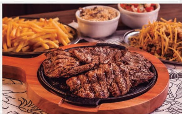
PLATE FILLET MIGNON